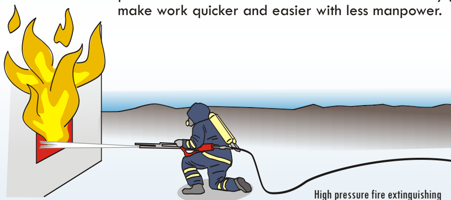
High pressure fire extinguishing