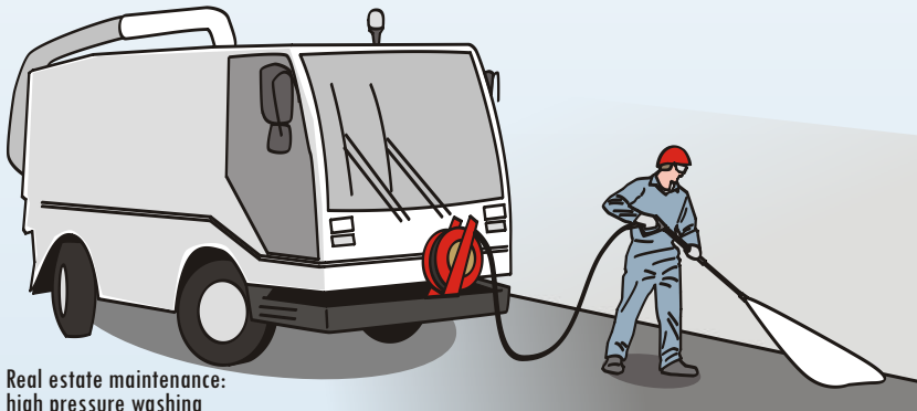
Real estate maintenance: high pressure washing

SAVE TIME! SAVE SPACE! SAVE MONEY! SAVE WATER! ADD VALUE!