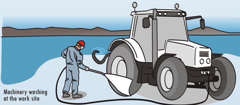
Machinery washing at the work site