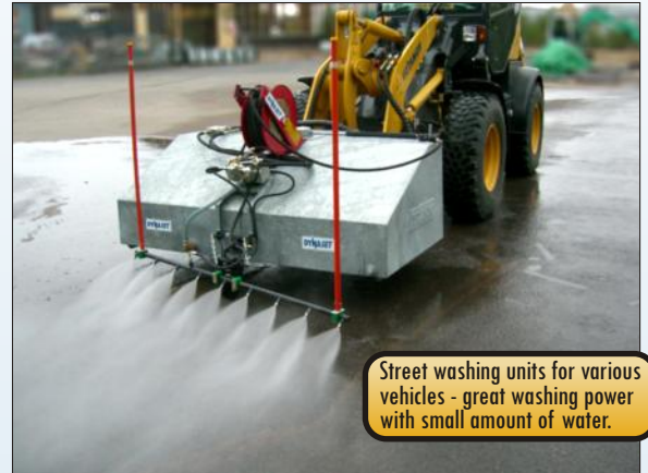
Street washing units for various vehicles - great washing power with small amount of water.